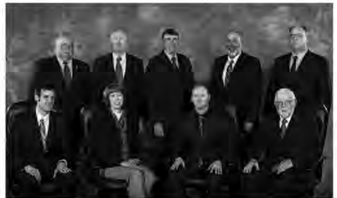
Consumers Energy Board of Directors